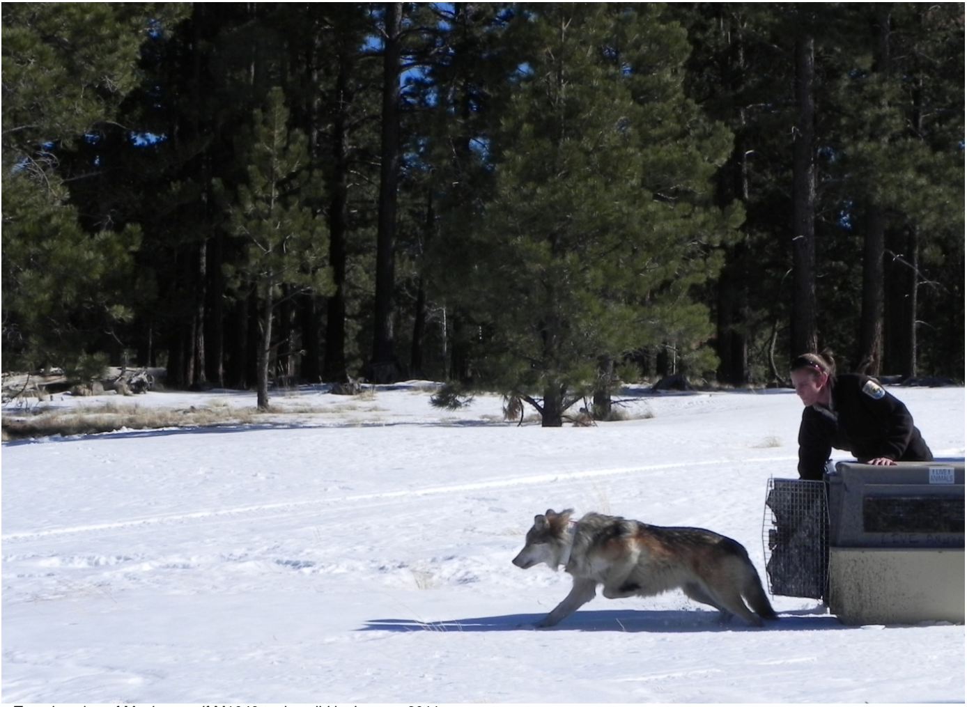
Translocation of Mexican wolf M1049 to the wild in January 2011